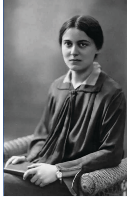
St. Teresa Benedicta of the Cross (Edith Stein), Virgin and Martyr

if reality is to unveil itself to the learner. Yet this basis in attention bears fruit in truth only when complemented by intellectual judgment, when the first act of the mind is completed in the formation of concepts and propositions that bear correct judgements. Such judgements bring the learner into accord with reality in a movement toward the equation of the mind with the real—the Thomistic (and more generally Scholastic) adaequatio rei et intellectus. But truth requires clarity. The world is brimming with meaning, meaning far