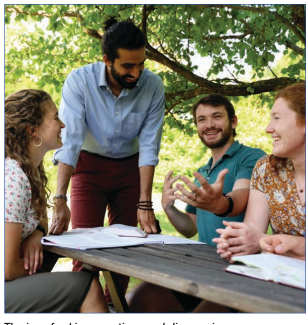
The joy of asking questions and discovering answers

And "technology paradigms" refers to the need to figure out how to implement technology in such a way that the technology truly serves humanity, and not the other way around. All three of these elements