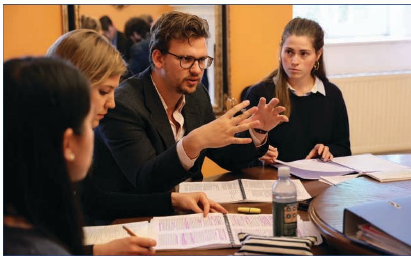
Good debates in the classroom bear much fruit

As one can see from what I have just described, at the ITI we are not exactly training students for particular professions. Rather, we are trying to effect a formation that is deeper and more basic to them, and yet which ought to prepare a young man or woman fundamentally for any subsequent occupation or walk of life. I think there are two points to highlight here: first, from a practical perspective, our students' engagement with the classical and Christian intellectual tradition is profoundly advantageous for their future lives in our post-Christian and, to some extent, postrational world: for in a largely relativistic intellectual and moral context, their studies with us shape their ability to reason, to draw conclusions from immutable principles, and to live, work and help others according to an objective order of reality. This is a blessing at any time, but it is a particularly precious one in today's cultural and social context.