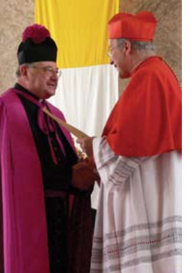
The Cardinal awards honorary Doctorate

of history and this Institute. I am particularly thankful that I was able to help