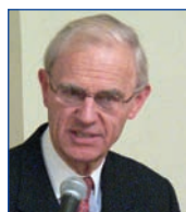
Dr. Onno Ruding