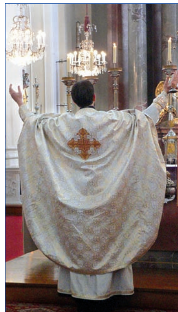
Visit to the pilgrimage site, Maria Dreieichen, February 2005

bridge between the East and West. Secondly, more than half of our students are from Central and Eastern Europe, which provides a natural mix and sharing of cultures. Thirdly, both the Byzantine and the Roman Rites are celebrated on our campus and the students are privileged to see both Rites unfold together throughout the school year. Fourthly, our theological studies delve into the Fathers and Doctors of the Church, both East and West. Finally, as a further outreach, our Byzantine Rite priests visit different Austrian parishes to celebrate Divine Liturgy and to explain more about the Eastern Rites in the Church. ✂