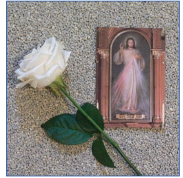
A rose and Divine Mercy invitation

The next day, the parish church was full as never before. Was it the mission, or love for the recently deceased pontiff, or the presentation of the parish children who received first Holy Communion? Probably all three. How better to honor the Holy Father in his last hours than to be the apostles of the new evangelization? ✂